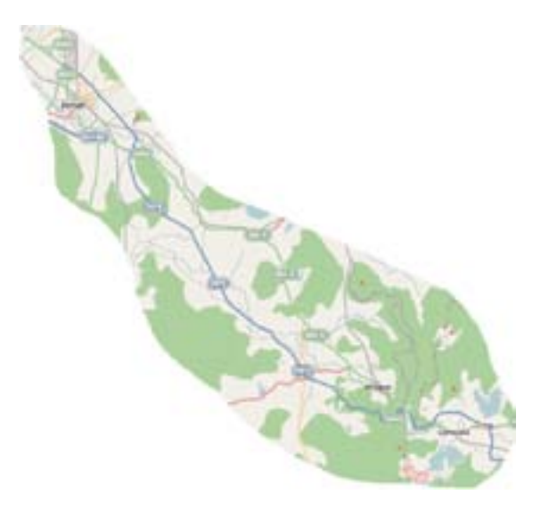
Fig. 1 Mumbai-Pune Express Highway Road illustration

For this experiment we used a Fedora 12 OS on which we have installed traffic and network simulator. In traffic simulator we created vehicles running on MPEH and with NS-2.34 we can have communication between vehicles using 802.11p [1-3] with an 2.5 dB omni-directional antenna and a GPS receiver (Gramin), DSRC transceiver and in-vehicle sensor. The radio transceivers are configured to work with ad-hoc network. GPS reports the latitude, longitude, speed of the vehicle for every 2 seconds. The location information reported by the GPS has an accuracy of 5-7 meters. We also obtained location information for every second. GPS readings helps in network performance measurement. All V2V communications were conducted using emergency broadcast at 2Mbps that allows us to explore basic communication performance because there is no RTS/CTS/ACK and retransmissions.