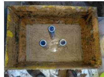
Fig. 1 Preparation of Clay Bed

Steel slag column groups were left floating in the clay. The columns were placed in a triangular pattern. As per IS 15284 the tank is first filled with clay up to a height of 15cm [4] from the bottom after which open ended pvc pipe casing of diameter 2.5cm were placed as shown in Fig 1 and it is filled around with clay sample. Crushed steel slag is filled in the hole in layers, casing pipe is gradually lifted and the steel slag is compacted with a tamping rod of 10 mm diameter and 1 m long with 25 numbers of blows falling freely from a height of 250 mm. This method of compaction gave a dry density of 16.82 kN/m 3 . The procedure is continued till the entire length of the steel slag column is formed as shown in Fig 2.