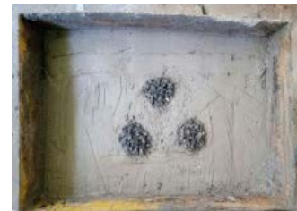
Fig. 2 Steel Slag Column Group on Clay Bed