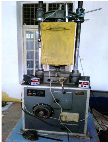
Fig 3 Application of Load

steel slag column and is placed in the loading frame. Loading plate of diameter 14 cm is placed over the steel slag column group, such that its center coincides with the center of the loading plate. Proving ring of capacity 50 kN is used to measure the load and two LVDT's were fixed for measuring the settlement. The loading frame setup is shown in Fig 3. The load is then applied slowly at a strain rate of 2.5 mm/min and corresponding settlement for each load increments are noted. The procedure is continued until the failure load is attained and the results are plotted. For different L/D ratios of steel slag column group the same procedure is repeated.