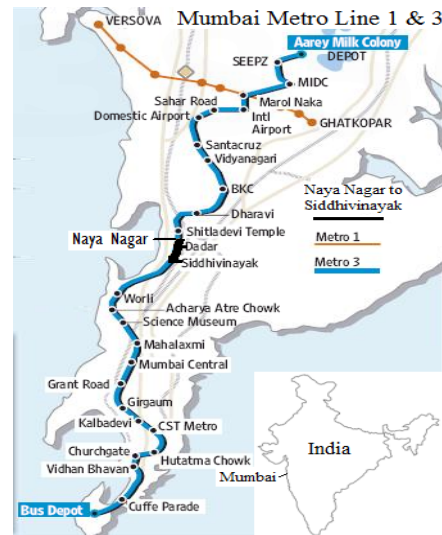
Fig. 1 Package UGC 04: Mumbai Metro Line-3

launched from Siddhivinayak towards Dadar station where it is received. Dadar acts as the mid-point for the proposed stretch and falls in between Naya Nagar launching shaft and Siddhivinayak station. The tunnels excavated between Naya Nagar shaft and Siddhivinayak station are 24 metres below the ground level and the shaft is 48 metres in width. The up line distance from Naya Nagar to Siddhivinayak is 3.6 km whereas the downline distance is 3.602 km and hence the total mining length of the tunnel is 7.202 km. The tunnel will have rings, which comprises tunnel segments which are proposed to be 2572 in number on the upline and 2574 on the downline, which sums to be 5146 for these two points.