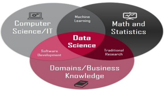
Fig.2 Data Science in Computer Science

7. Machine learning: Machine learning is backbone of data science. Machine learning is all about to provide training to a machine so that it can act as a human brain. In data science, we use various machine learning algorithms to cover the issues.