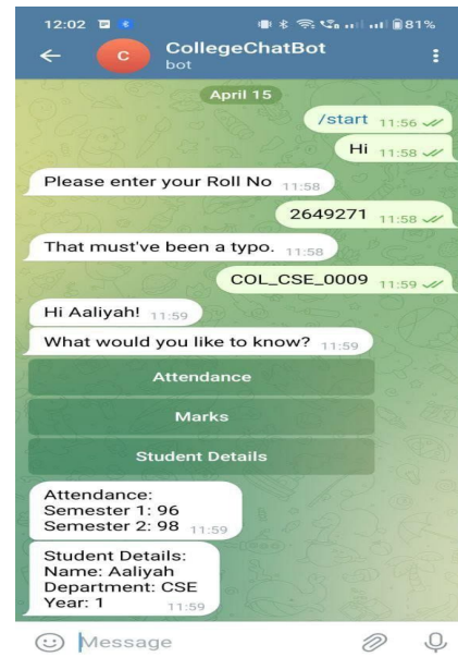
Fig. 3 Performance of Chatbot

The effectiveness of the chatbot’s responses was evaluated, as was the speed with which the intranet portal met the user’s needs. The investigation revealed that the time needed to respond is proportional to the number of lines in the chatbot’s