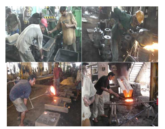
Fig. 4 Workers Performing various activities in awkward postures

TABLE, IV PROCESS-WISE DISTRIBUTION OF OWAS SCORE