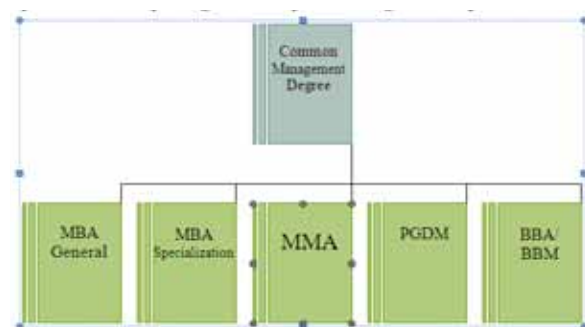
Fig. 1 The popular Management degrees in India

The management is a social process entailing responsibilities for the effective and economical planning and regulation of the operations of an enterprise. Normally management is involved with judgment and decision in determining plans, the guidance, integration and supervision of the personnel composing the enterprise caring out its operation.