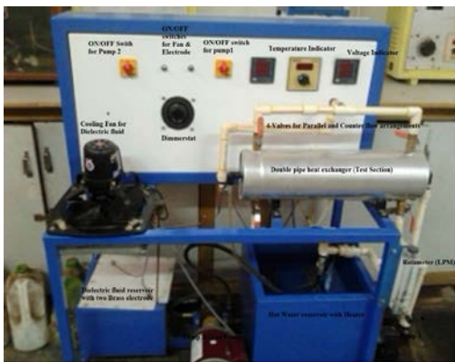
Fig. 2 Photo of experimental setup

The selection of appropriate materials to conduct and transfer heat at better rate and efficiently is very important criteria in heat exchanger design. In this experiment, the Copper material is selected for inner tube as it is thermally efficient and durable and outer tube is made of M.S. material. The readings are taken for constant mass flow rates and with electrohydrodynamic (EHD) effect.