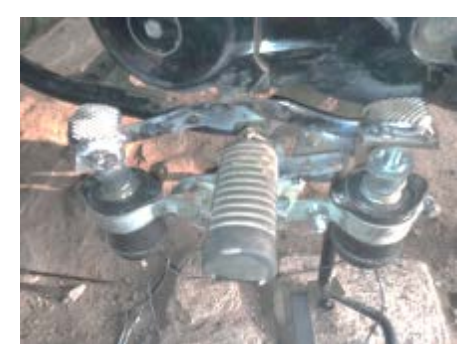
Fig. 2 Mounting Top View

Solenoid completed one up and down motion called as one stroke. This stroke time depend on supplied voltage and current. According to stroke length and voltage calculation, mount solenoids on both sides of gear shifting pedal at ends. By providing appropriate voltage it pulls the plunger downward and by cutting off supply it retracts plunger upward.