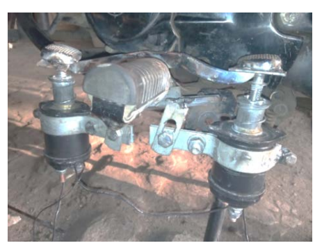
Fig.3Mounting Side View