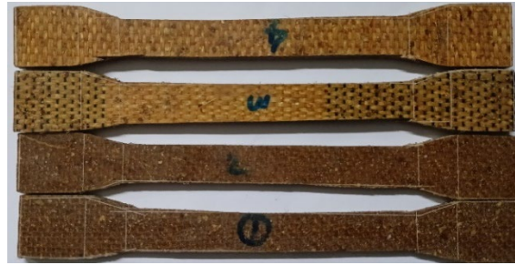
Fig. 2 Samples before tensile test

a calculation of the composite laminates' ultimate tensile strength. In Table II, these findings are summarized.