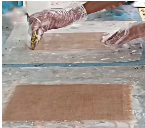
Fig.1 Preparation of Laminates

In the current research Jute, palm, banana fibers and sea shell, groundnut husk powders was used as composite materials. The laminate pieces were made by using hardener HY951 and epoxy resin LY556 in a 1:10 ratio. The composite laminates are prepared by using manual hand layup method shown in Fig. 1 and their compositions in Table I.