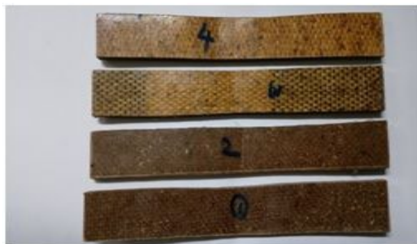
Fig. 4 Samples Before Compression test

All laminates were put through a stress test using a fixture that was based on the ASTM D695 standard. The