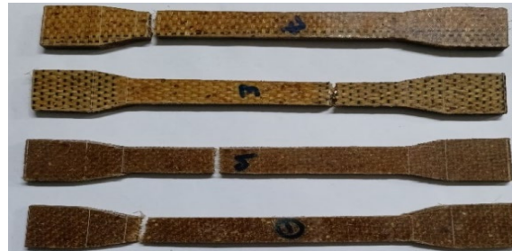
Fig. 3 Samples after tensile test