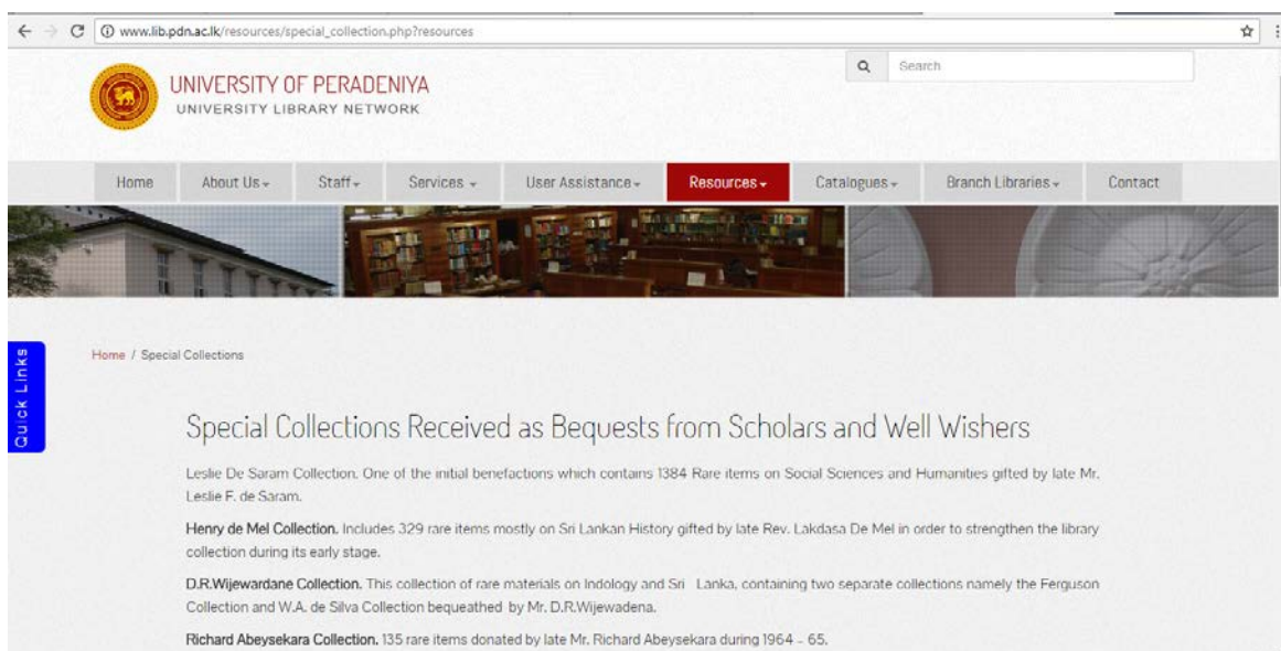
Fig. 3 Special Collections Received as Bequests from Scholars and Well Wishers