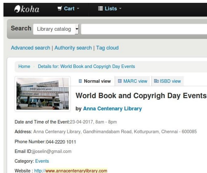
Fig. 1 OPAC View of a Community Information