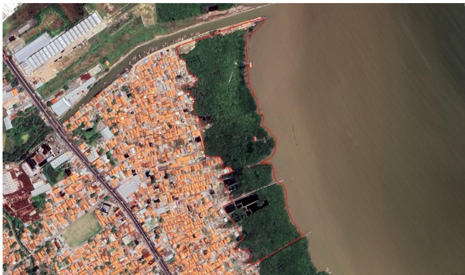
Fig. 5 Longitudinal Change in Mangrove Coverage in Mundu Pesisir 2025

consists of a highly vulnerable coastline with little vegetation, covering an area of about 8.68 ha, which made the community susceptible to erosion and tidal flooding. The spatial analysis was conducted by Google Earth Pro for image acquisition and QGIS (Quantum Geographic Information System) for area polygons and distance calculation from the coast.