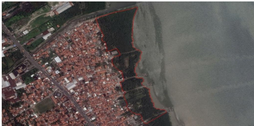
Fig. 3 Longitudinal Change in Mangrove Coverage in Mundu Pesisir 2016

highly vulnerable coastline with very little vegetation, covering about 5,14 ha, making the settlement susceptible to high levels of erosion and tidal flooding. The spatial analysis was done through Google Earth Pro for obtaining historical images and QGIS (Quantum Geographic Information System) for measuring areas and distances.