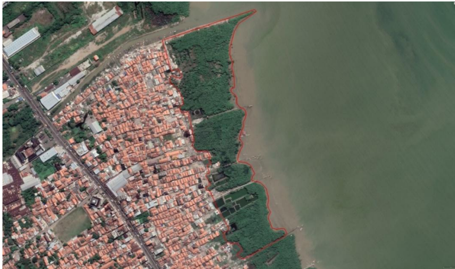
Fig. 4 Longitudinal Change in Mangrove Coverage in Mundu Pesisir 2021

coastline with little vegetation, occupying about 7.56 hectares. Spatial analysis was done through Google Earth Pro and QGIS (Quantum Geographic Information System).