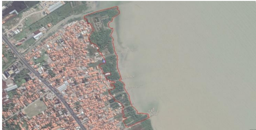
Fig. 2 Longitudinal Change in Mangrove Coverage in Mundu Pesisir 2011

analysis and longitudinal observation in the field, there have been significant changes in ecology within the area, mainly due to the continuous participation of the community. In particular, the data show continuous development of the areas covered by mangroves, which increased from the base of 5,14 hectares in 2011 to 7,56 hectares in 2016, 8,68 hectares in 2021, and 9,75 hectares in 2025, amounting to an overall increase of 89,7% over 14 years. This development can be regarded as evidence of ecological recovery and successful mitigation activities in the reduction of the reach of tidal floods. The analysis was conducted with the help of Google Earth Pro software (for obtaining historical images) and QGIS (Quantum Geographic Information System).