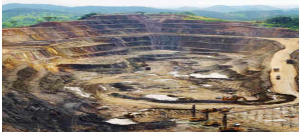
Fig. 1 A Panoramic view of a Mine in Goa

contents are high. Also, chloride is high. Molybdenum when it exceeds it causes 'molybdenosis' which interferes the growth, nutrition and reproduction. The laterites are rich of trace elements of B, Ga, Ge. If Boron content is high it leads to cancer. Mining is the back bone of the Goa states economy after Tourism, so it has to continue. About 5 lakh people are employed both direct and indirect means. Thus, mining has to continue keeping the Environmental laws.